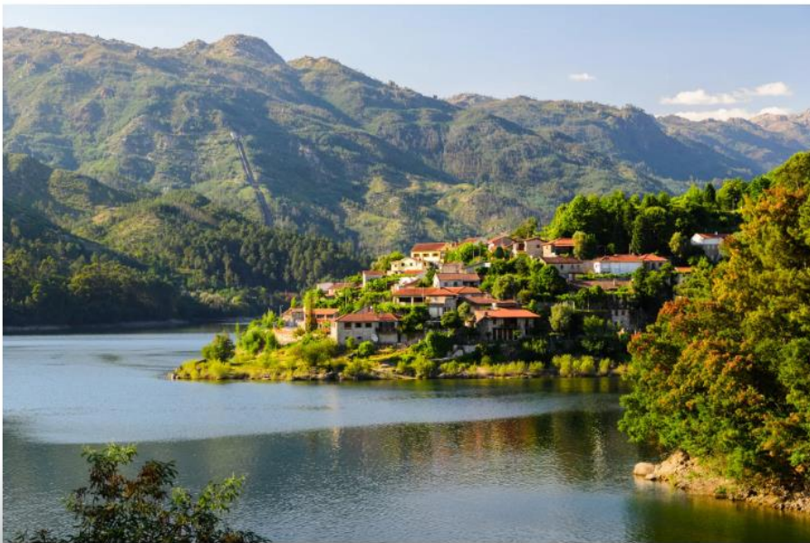
A view of the Cavaço river and Peneda-Gerês National Park in northern Portugal.

“The landscape is one of undulating, verdant hillsides with two rivers flowing throughout (the Minho and the Lima) and diverse microclimates that allow for unique, varied wines—not all of which are the fizzy style you might expect.