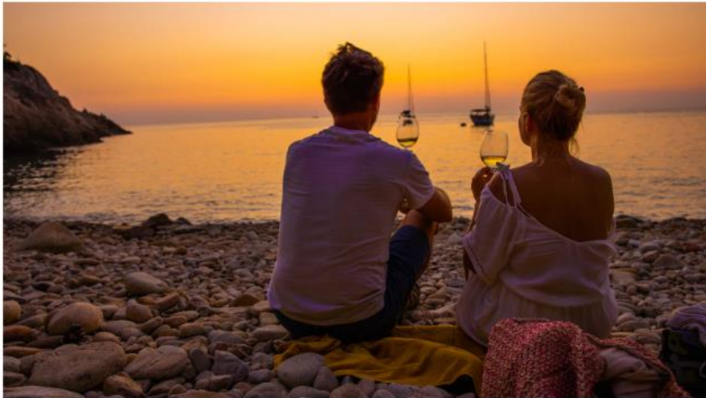
From old-vine Pils to off-dry Riesling, these are the wines that pros are packing in their coolers.

12 top wine pros share their favorite bottles and cans for sipping seaside